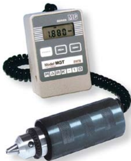
MGT Economy Torque Gauge

The MGT Digital Torque Gauge provides basic torque measuring with a wide range of capacities at an economical price where added features are unnecessary.